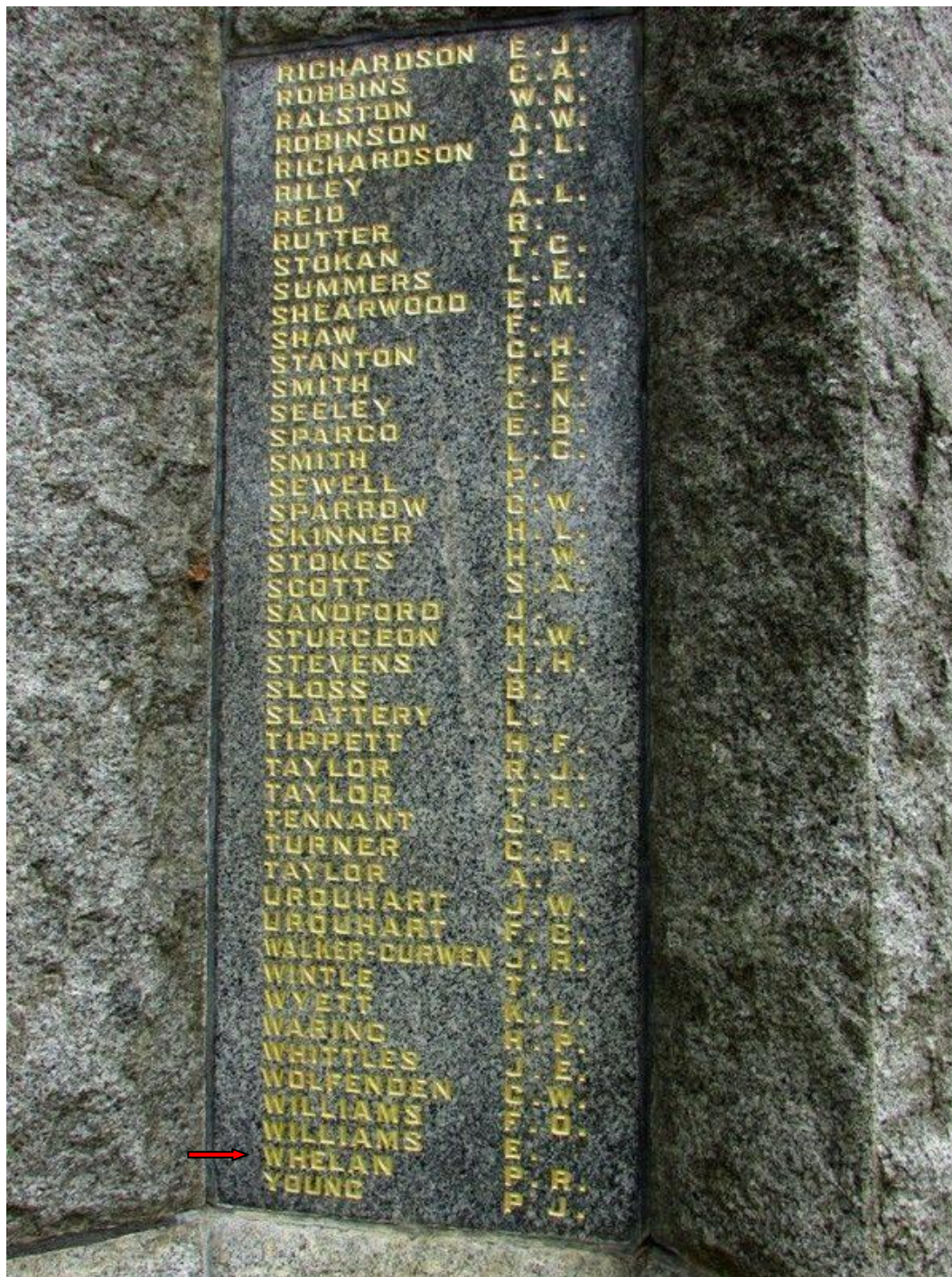
Malvern War Memorial