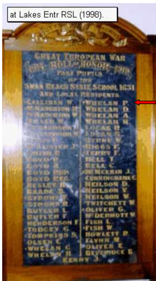
Swan Reach State School Honour Roll